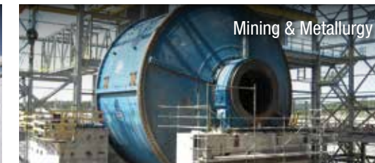
Mining & Metallurgy