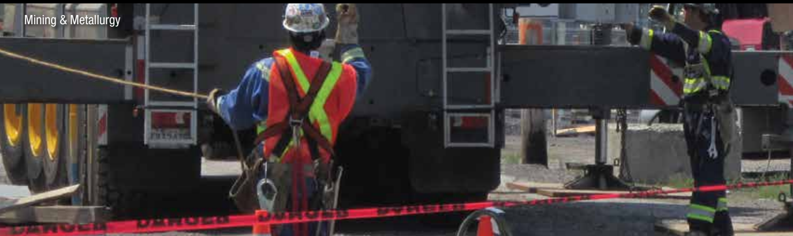
Mining & Metallurgy

UNCOMPROMISING STANDARDS COUPLED WITH DIVERSE CAPABILITIES & EXPERIENCE