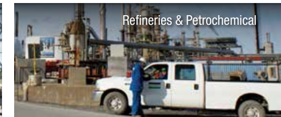
Refineries & Petrochemical