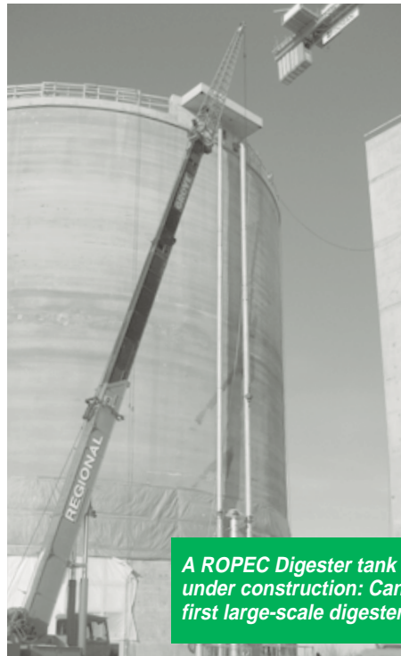
A ROPEC Digester tank under construction: Canada's first large-scale digesters

For BBS to be most successful however we must diligently practice in its processes. By doing so we shall reap the rewards which come by having a safer and accident free workplace for all our employees.