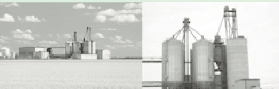
The APLP's Ste. Agathe, Manitoba facility, located just outside Winnipeg