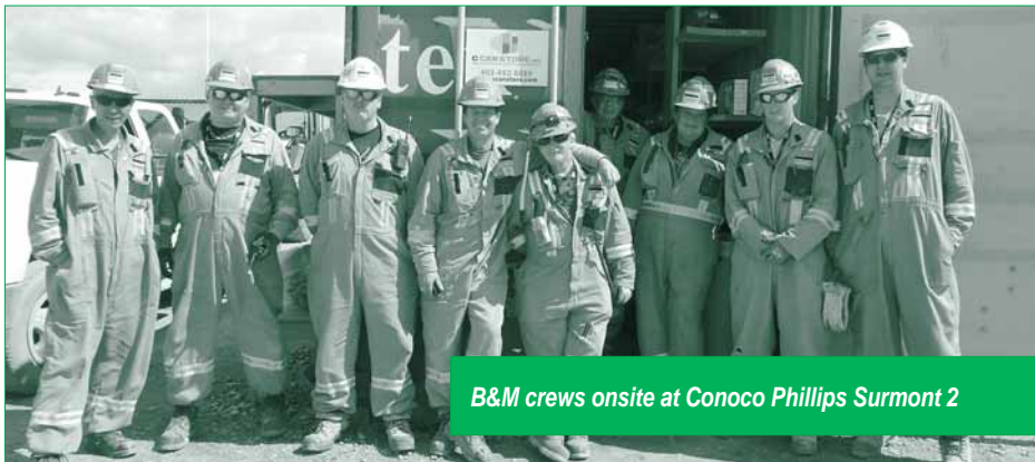
B&M crews onsite at Conoco Phillips Surmont 2

The Western Canadian Industrial Region is a leader in safety on each of our projects, with over 2.5 million hours and counting with 0 LTI's since our inception in 2012. By diligently following Black & McDonald's HSE Management System and supporting a strong safety culture, the goal of "Nobody Gets Hurt, Today or Tomorrow" is achievable.